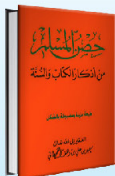
HISN AL MUSLIM