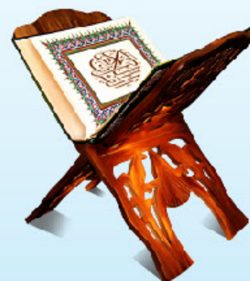
THE GLORIOUS QURAN