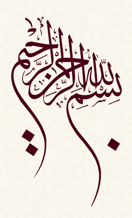
In the Name of Allah, the Most Beneficent, the Most Merciful